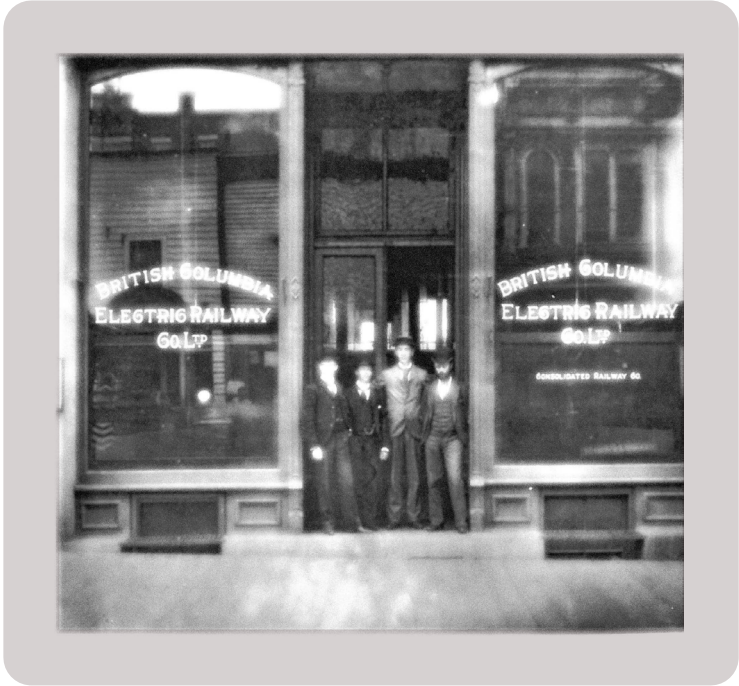
MoveUP's humble beginnings began as a small social club in 1913 at what was the British Columbia Electric Railway Company.

MoveUP's Events & Social Planning Committee also continues the legacy of that early social group at BC Electric by planning social events that allow members to come together and enjoy one another's company outside of the work environment although, today, that work involves hundreds if not thousands of members.