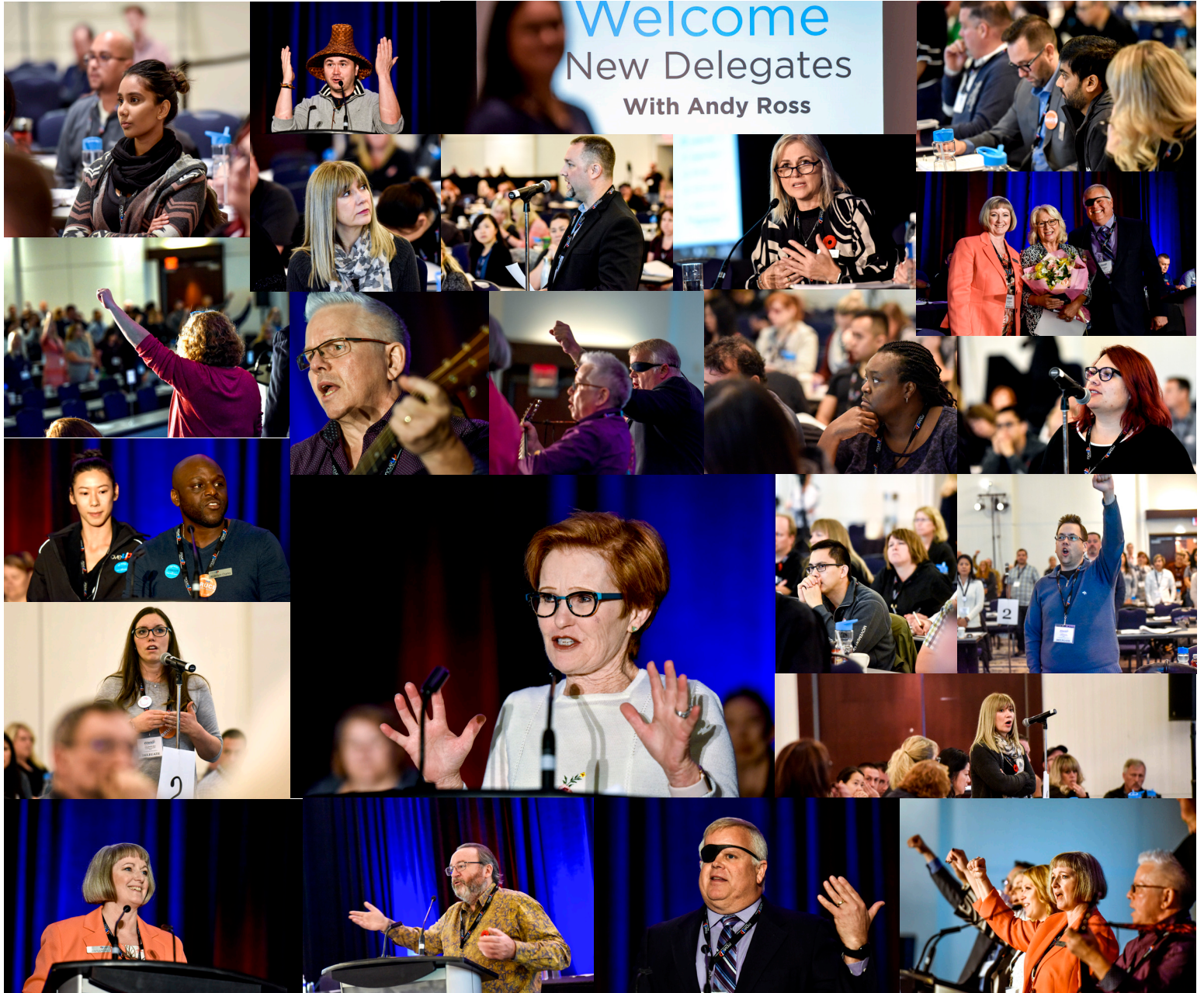
PHOTO HIGHLIGHTS - THURSDAY

JOIN US FOR THE LATEST UPDATES OUR CONVENTION HAS GONE MOBILE